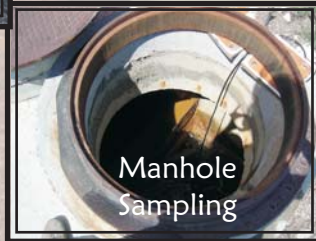
Ground Water, Storm Water, Pit Lake Sampling, Process Component Monitoring & Reporting