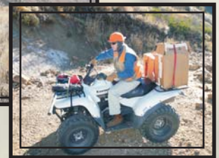
Reclamation Reseeding Services