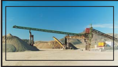
Air Quality Visual Emissions Evaluation Testing & Reporting