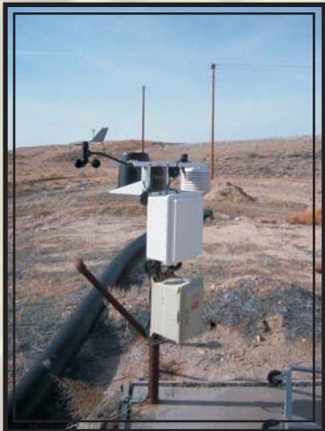
Weather Station Data Collection