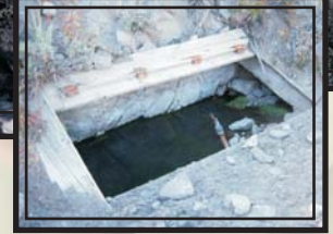
Seep & Spring Surveys Regional Ground & Surface Water Data Compilation